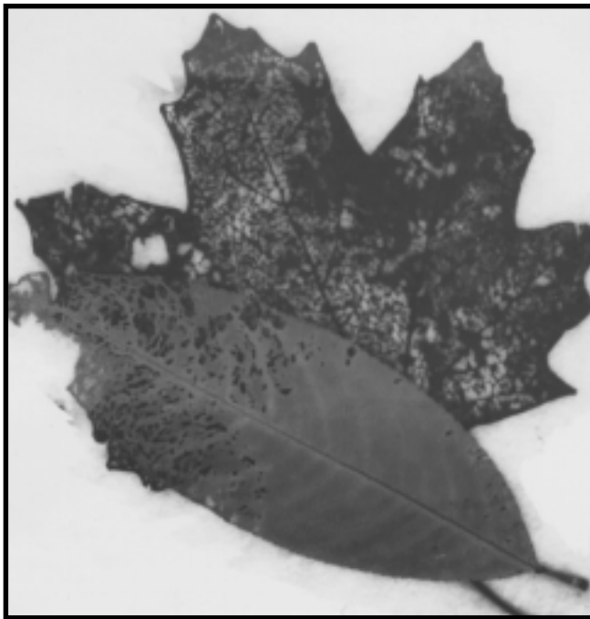
Figure 2. Leaves damaged by Japanese beetles.

Mid-summer rainfall and adequate soil moisture are needed to keep eggs and newly-hatched grubs from drying out. During dry periods, females lay their eggs in low, poorly-drained areas. Older grubs are relatively drought resistant and will move deeper into the soil if conditions become very dry. Japanese beetle grubs also can withstand high soil moisture, so excessive rainfall or heavy watering of lawns does not bother them.