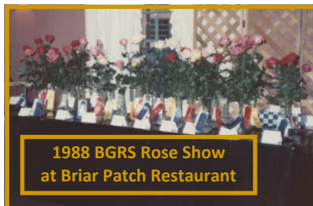
1988 BGRS Rose Show at Briar Patch Restaurant