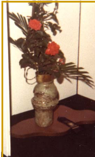
1981 BGRS Rose Show blue ribbon arrangement.