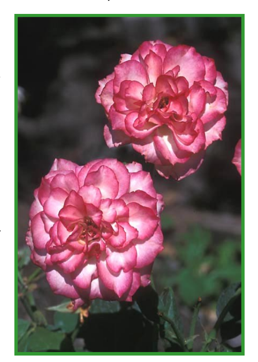
Nicole photo from www.rose-roses.com