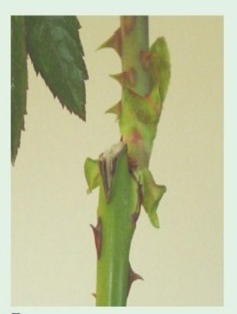
Pruning cut made causing damage to outer epidermis and therefore permitting potential infection