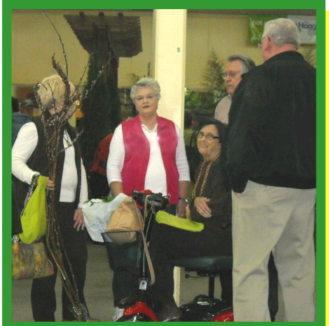
BGRS members at Nashville Lawn & Garden Show

We need new members, so think of someone who is interested in their yard or growing flowers and bring them to our meeting.