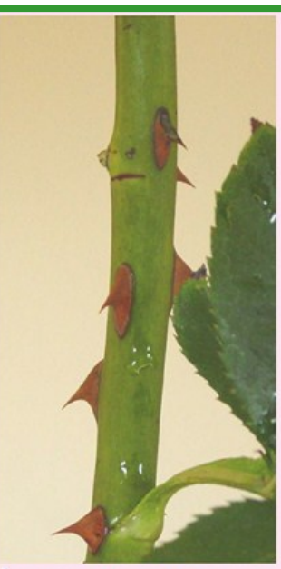
Locating the dormant eye (stem rotated 90 degrees to accentuate the exact location of the spot)