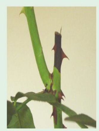
Pruning cut made too far above the bud eye causing severe die-back almost to the junction