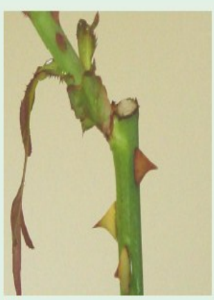
Pruning cut made too close to developing eye