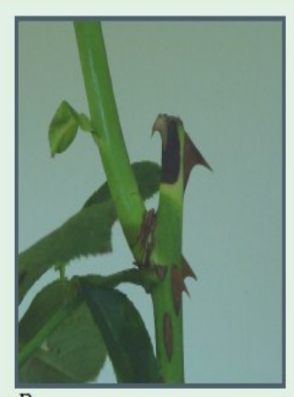
Pruning cut made too far above the eye causing partial die-back