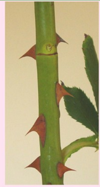
Locating the dormant eye by looking for a small circular swelling pimple at the junction where a leaf

growth, since growth often finds it impossible to break through the heavy tree-like bark encountered on older bushes. Finally, save on profanities while pruning by buying a good strong pair of leather gauntlet gloves or hand gloves that are puncture proof.