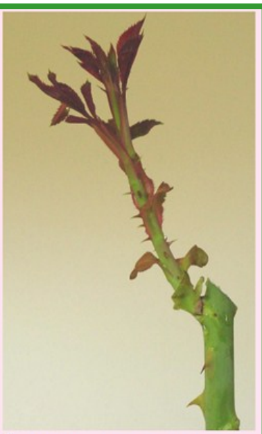
Emerging new growth after approx. 3-4 weeks providing stems bearing flowers