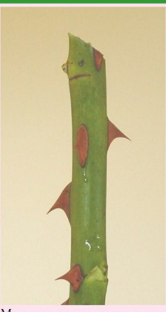
Making that all important cut to promote the new growth in the correct direction away from the center of the bush