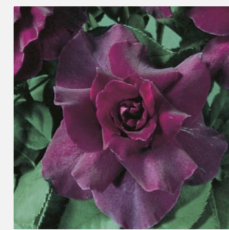
Top: 'Tyler', 'Shreveport', 'Pink Peace', 'Dream Come True' Bottom: 'Wedding Bells', 'Raspberry Kiss', 'Charisma', 'Intrigue'