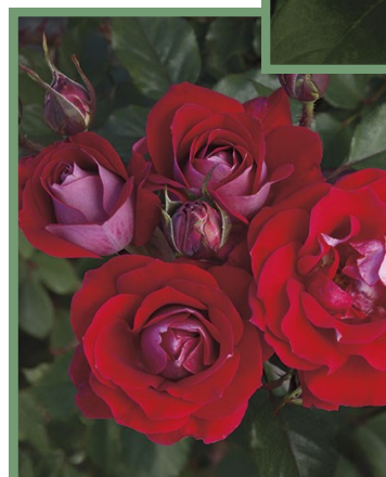
'Take It Easy'