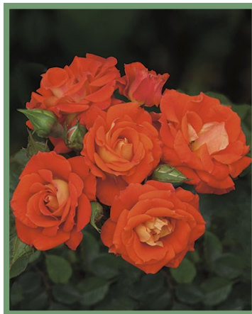
'Top of the World'