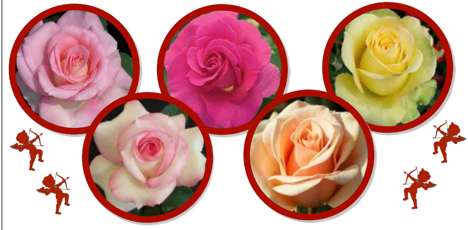
Some of the roses to be auctioned: "Falling in Love', 'Gentle Giant', 'St. Patrick', 'Moonstone', and 'Marilyn Monroe'.

So mark your calendars today and get registered to attend the 2015 Tenarky Winter Workshop in Franklin February 20-22.