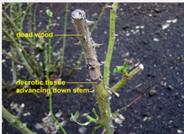
Examples of dead rose wood and necrotic tissue advancing down the rose stem.

Damaged or diseased wood is also easy to spot, and often goes hand in hand as damaged areas create entry opportunities for diseases. In roses, damaged areas are common on crossing branches, where motion from wind causes thorns to rub against adjacent canes. Wind damage can also occur during the main growing season when top-heavy branches laden with blooms snap in half during stormy weather. Diseased branches usually involve some type of stem canker or lesions from fungal diseases like black spot or downy mildew, and should be removed promptly to prevent the pathogen from spreading.