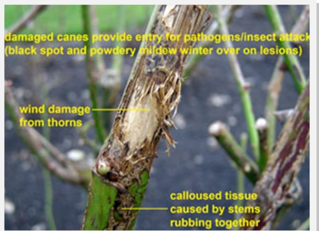
Damaged canes provide entry for pathogens and insect attack (black spot and powdery mildew winter over on lesions).