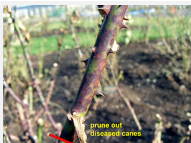
Prune out diseased canes. Again, the overall goal with rose pruning is to open up the center of the bush to allow for better air circulation and remove older wood. Maintaining a youthful, clean rose plant is the best way to keep your rose healthy and productive.