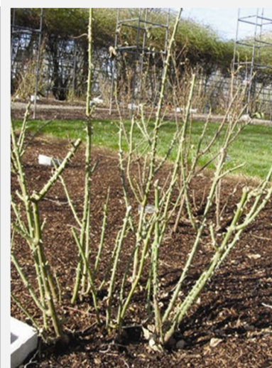
Left: BAD—Too congested in center of plant. Right: GOOD—Open center allows air to circulate.