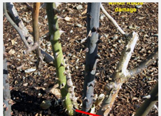
Example of winter freeze damage.