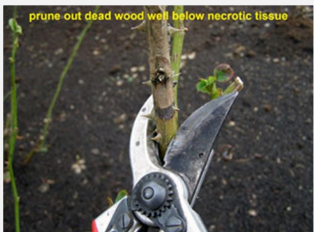
Prune out dead wood well below necrotic tissue.