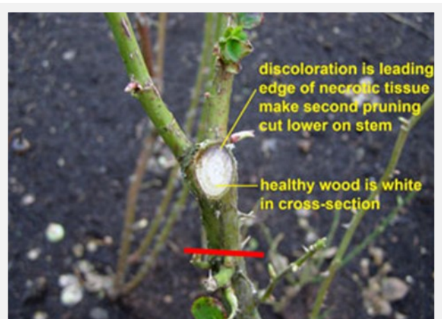
Discoloration is leading edge of necrotic tissue. Make a second pruning cut lower on stem. Healthy wood is white in cross-section.