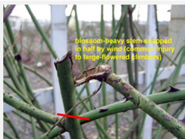
Blossom-heavy stem snapped in half by wind (a common injury to large-flowered climbers).